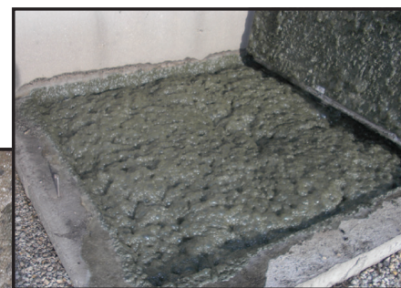
Foaming Manure Pit

More from Every Acre, Animal & Gallon of Manure